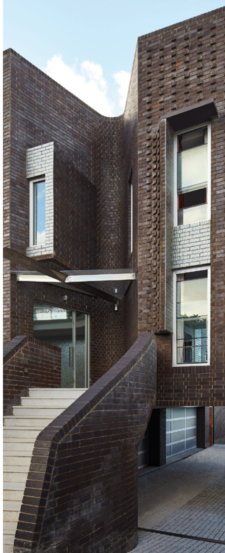
Applecross House (WA) Elements Zinc by Austral Bricks