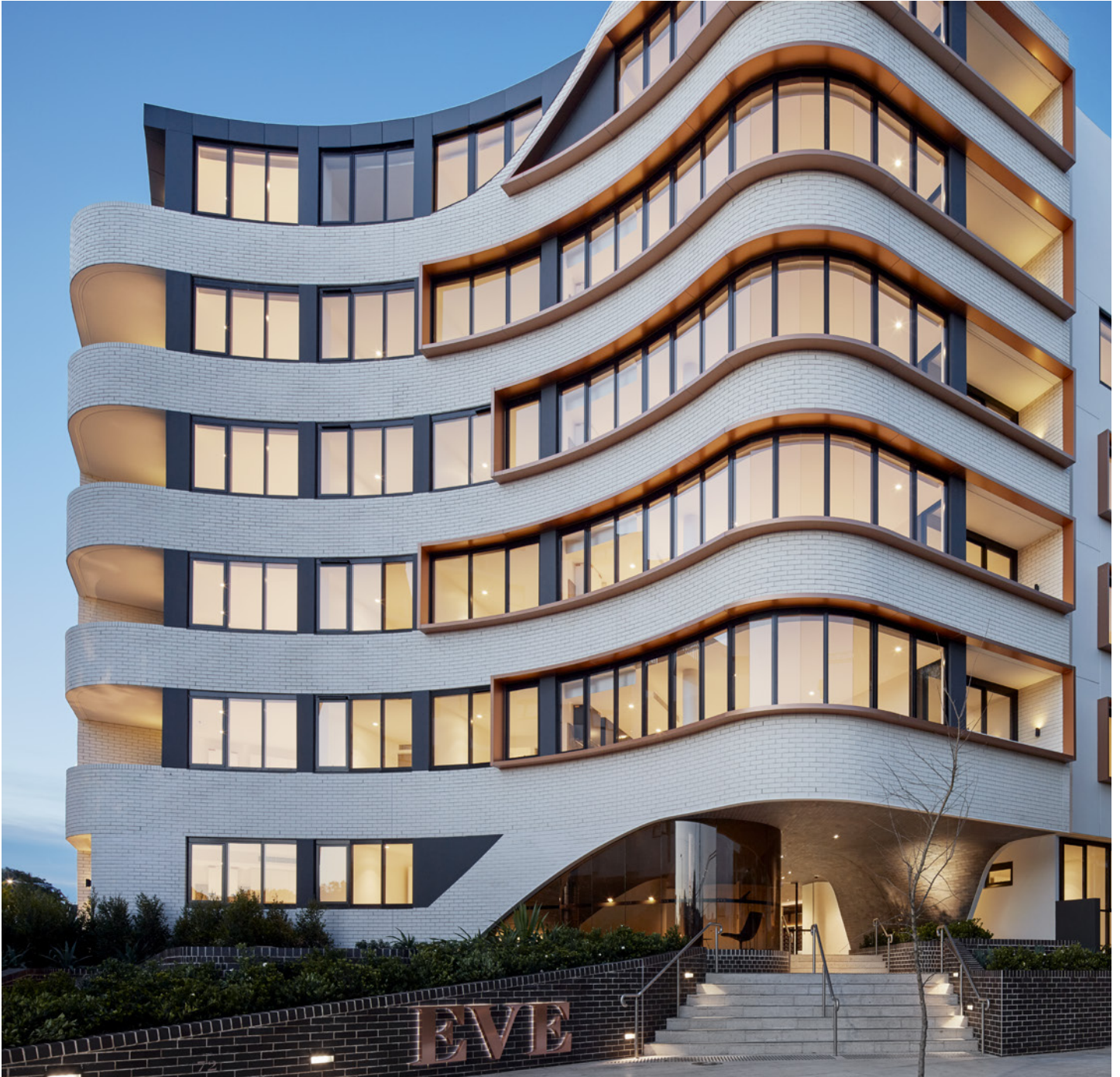
▲ EVE uses La Paloma Miro white bricks and Austral Precast concrete panels to create a striking high rise.

Brickworks is breaking new ground with its involvement in high rise building projects.