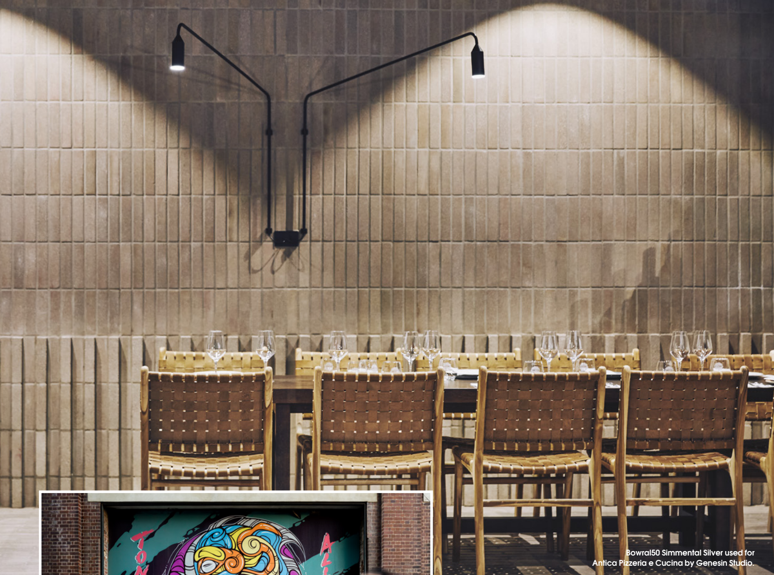
Bowral50 Simmental Silver used for Antica Pizzeria e Cucina by Genesin Studio.