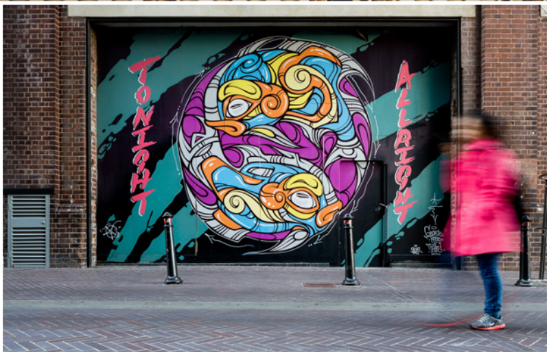
▲ Bowral dry-pressed bricks transformed Kensington Street into a vibrant social hub.