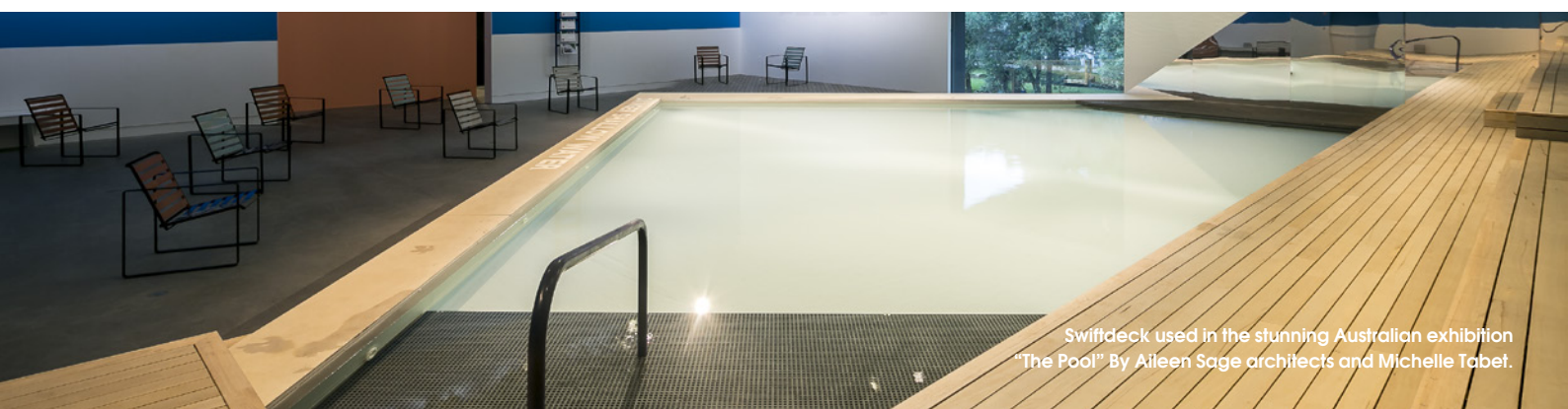
Swiftdeck used in the stunning Australian exhibition "The Pool" By Aileen Sage architects and Michelle Tabet.

Upon returning to Australia events were held in all Brickworks design studios for invited architects to see and hear about the success of Australia's latest architectural exhibition.