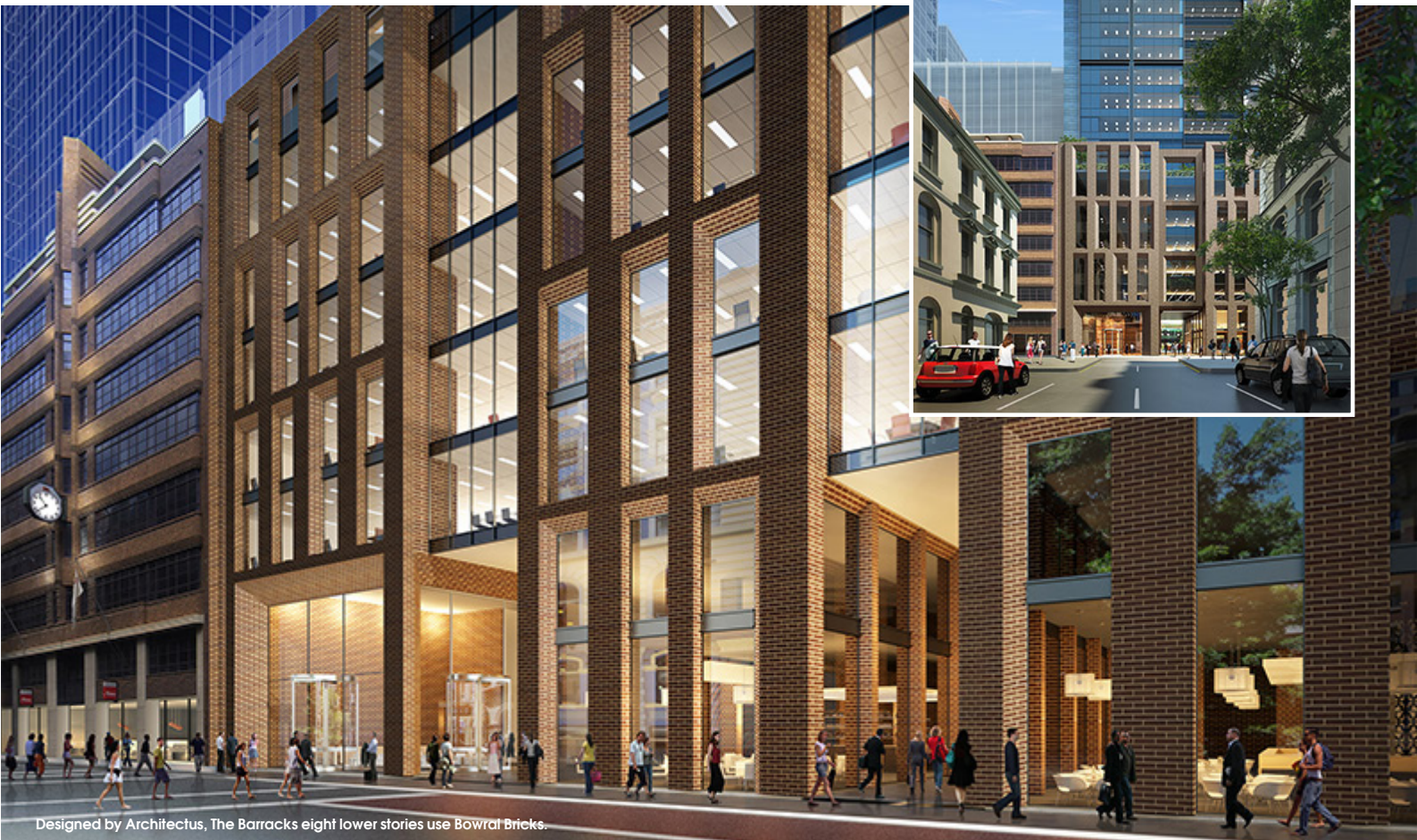
Designed by Architectus, The Barracks eight lower stories use Bowral Bricks. Builder: Build, Architect: Architectus, Developer: Investa Property Group, Developer: Crown International