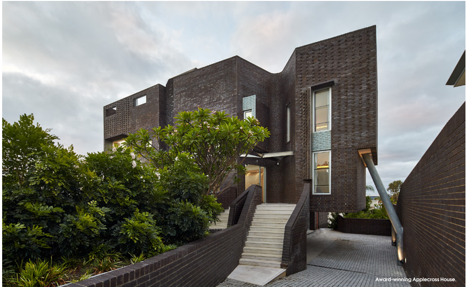
Award-winning Applecross House.