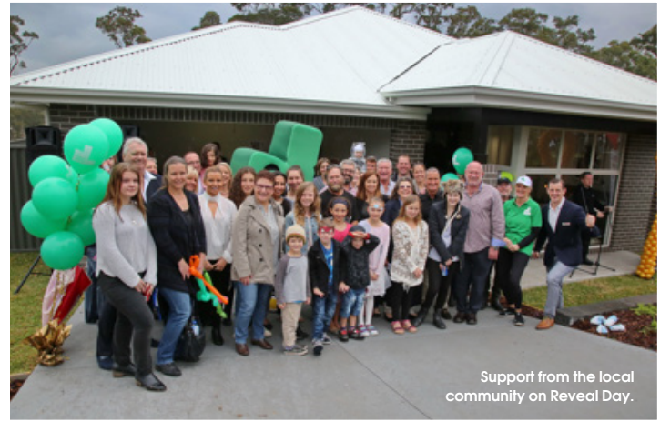
Support from the local community on Reveal Day.

This year, we are pleased to have made a sizeable donation of bricks for the construction of a brand new charity house, which is to be auctioned in late October 2016, as part of the 2016 'Build for a Cure Campaign'.