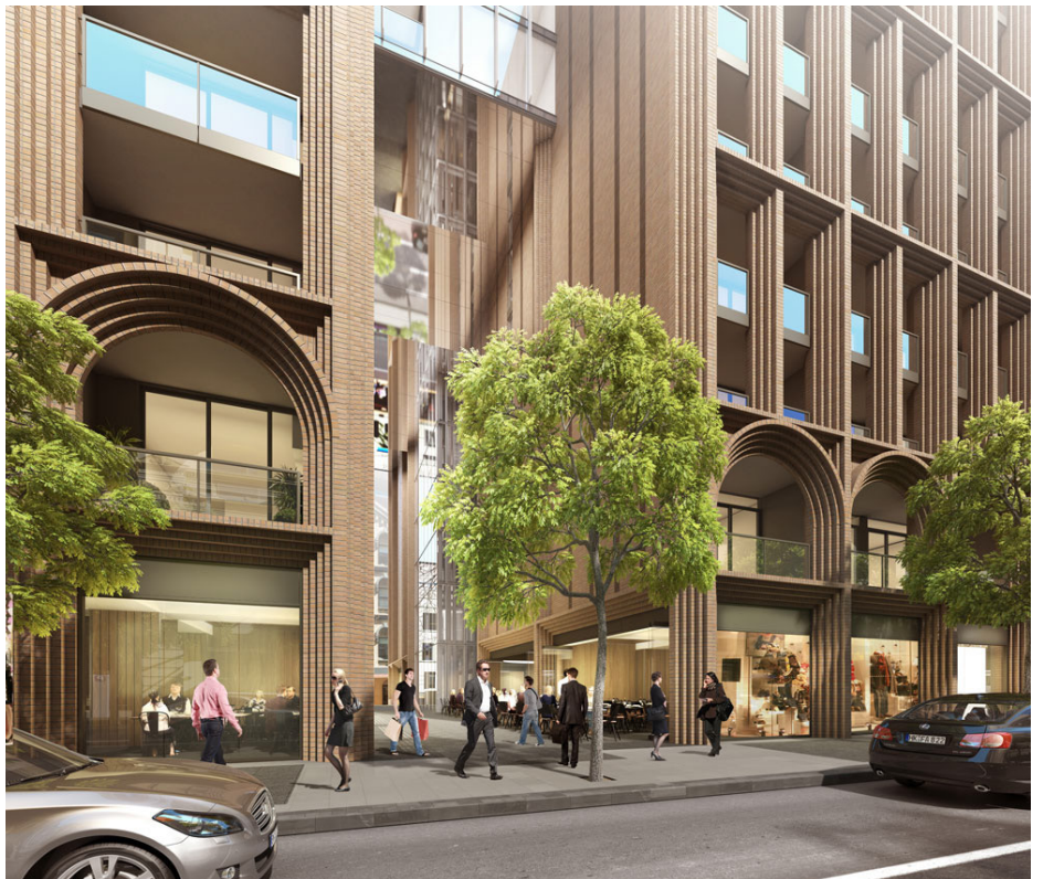
▲ Arc by Crown is a mixed use development comprising of both retail stores and residential apartments. Builders: Hutchinson Builders, Architect: Koichi Takada Architects, Grimshaw Architects and Hassell

The last five years has witnessed a quantum shift in the use of brick in architecturally designed projects. Helping to create high rise buildings that inspire and excite is a new and welcome avenue for Brickworks. It's also an avenue the organisation intends to explore with vigour.