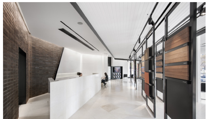
▲ Award-winning Adelaide Design Studio.

In recent months, a number of Brickworks design studios have won a swag of architecture and design awards. Our design studios can be found in Perth, Adelaide, Melbourne, Sydney, Brisbane and Hobart. They are integral to the work of Brickworks in being able to provide builders, architects and consumers with the opportunity to explore new ways to view and select our products for their home or building project.