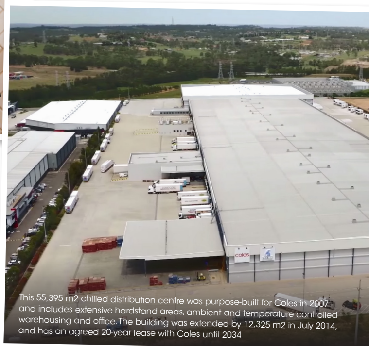
This 55,395 m2 chilled distribution centre was purpose-built for Coles in 2007, and includes extensive hardstand areas, ambient and temperature controlled warehousing and office. The building was extended by 12,325 m2 in July 2014, and has an agreed 20-year lease with Coles until 2034

"Releasing capital from stabilised assets such as these means that we can reduce gearing in the Property Trust or across Brickworks and its entities. It also provides equity for the ongoing development of vacant trust land and other development land held by the Group.