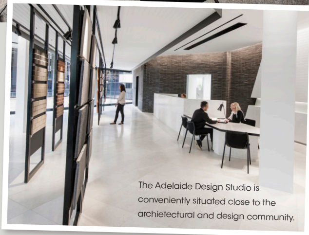
The Adelaide Design Studio is conveniently situated close to the architectural and design community.